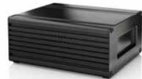
Radio Transceiver + Alfatronix Desktop Power Supply + Alfatronix Battery Back Up Box