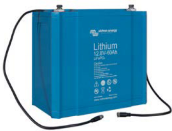
12,8V 60Ah LiFePO 4 Battery