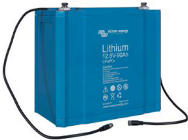
12,8V 90Ah LiFePO 4 Battery

Our 12V BMS will support up to 10 batteries in parallel (BTVs are simply daisy-chained).