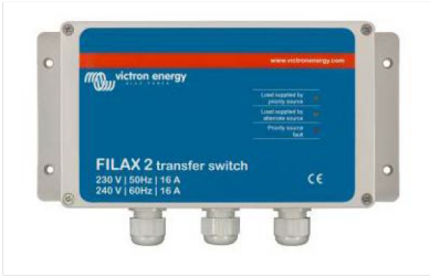
Filax 2: ultrafast transfer switch