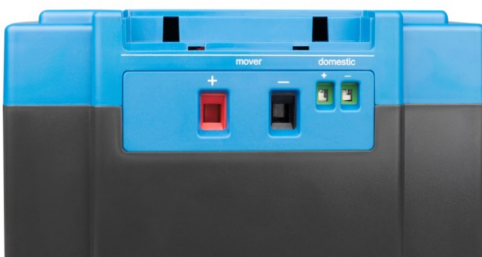
High capacity output (mover) and low capacity output (domestic)