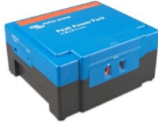
12.8 V, 8Ah