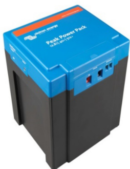
12.8 V, 40Ah