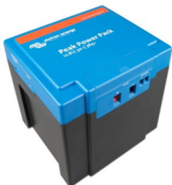
12.8 V, 30Ah