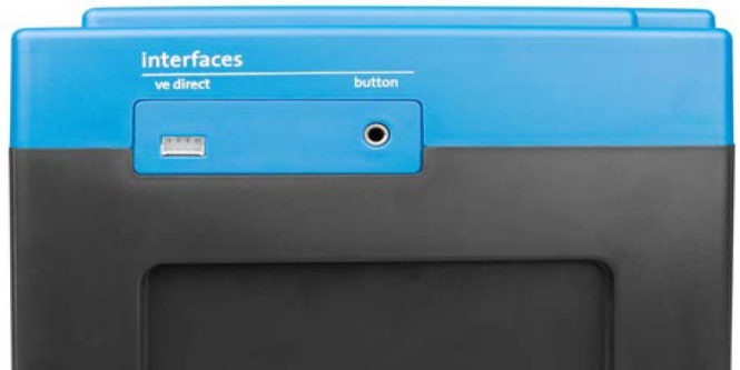
VE.Direct and push-button