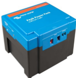
12.8 V, 20Ah