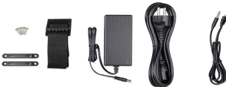
Fixing strap Adapter Power cable Push-button with cable (2m) and dual-colour LED