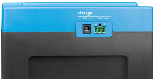
Adapter and input vehicle / solar panel (car/solar) (socket for the car/solar input comes supplied)