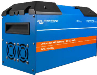
24V/100Ah HE battery