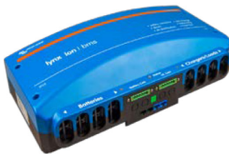
Lynx-ion BMS 1000A