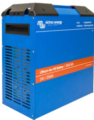
24V/200Ah HE battery