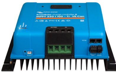
SmartSolar Charge Controller MPPT 250/100-Tr VE.Can without display