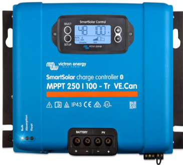
SmartSolar Charge Controller MPPT 250/100-Tr VE.Can with optional pluggable display