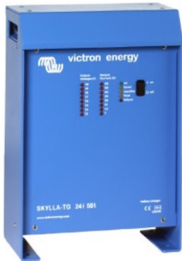
Skylla Charger 24 V 50 A