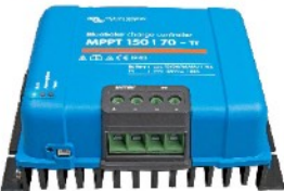
Solar Charge Controller MPPT 150/70-Tr