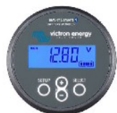
Bluetooth sensing: BMV-712 Smart Battery Monitor or SmartShunt