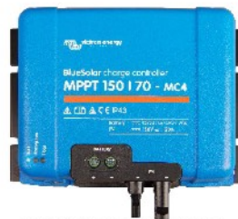
Solar Charge Controller MPPT 150/70-MC4