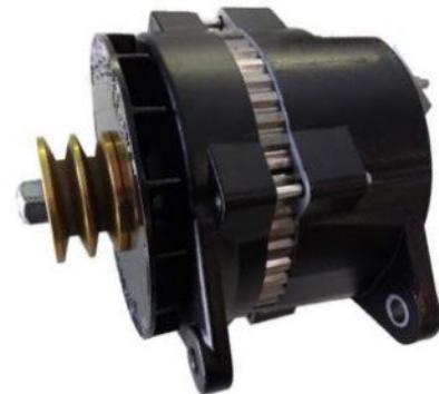
97EHD-Series 85A & 110A, 24V

Contact Balmar Tech Service to learn more about the 97EHD-Series Alternators!