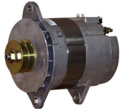
97EHD-Series 190A, 24V Model