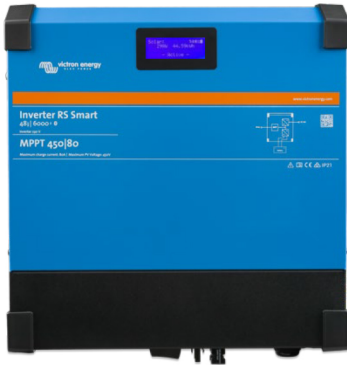
Inverter RS Smart 48/6000