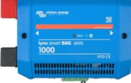
Lynx Smart BMS 1000 A