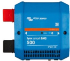
Lynx Smart BMS 500 A