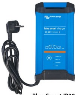
Blue Smart IP22 12/30 (3)