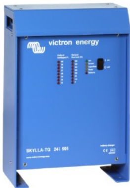
Skylla Charger 24 V 50 A