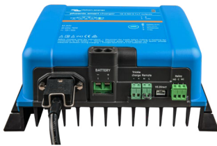
Phoenix Smart 12/50(1+1)