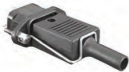
Retainer clip (included)