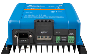
Phoenix Smart 12/50(3)