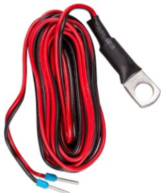
Temperature sensor for Quattro, MultiPlus and GX device (e.g. Ekrano GX) as an additional accessory.