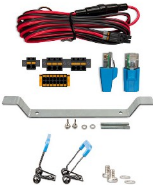
Accessories included with the Ekrano GX

The Ekrano GX installs easily via a cut-out for flush panel mounting and includes both a steel bracket and springs for blind hole mounting. All ports are easily accessible from the back. The power and relay terminal blocks can be screwed in place and the IO terminal block has a quick release clamp for easy access. The Bluetooth feature allows for quick connection and configuration via our VictronConnect app.