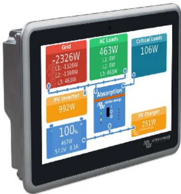
Ekrano GX front and back